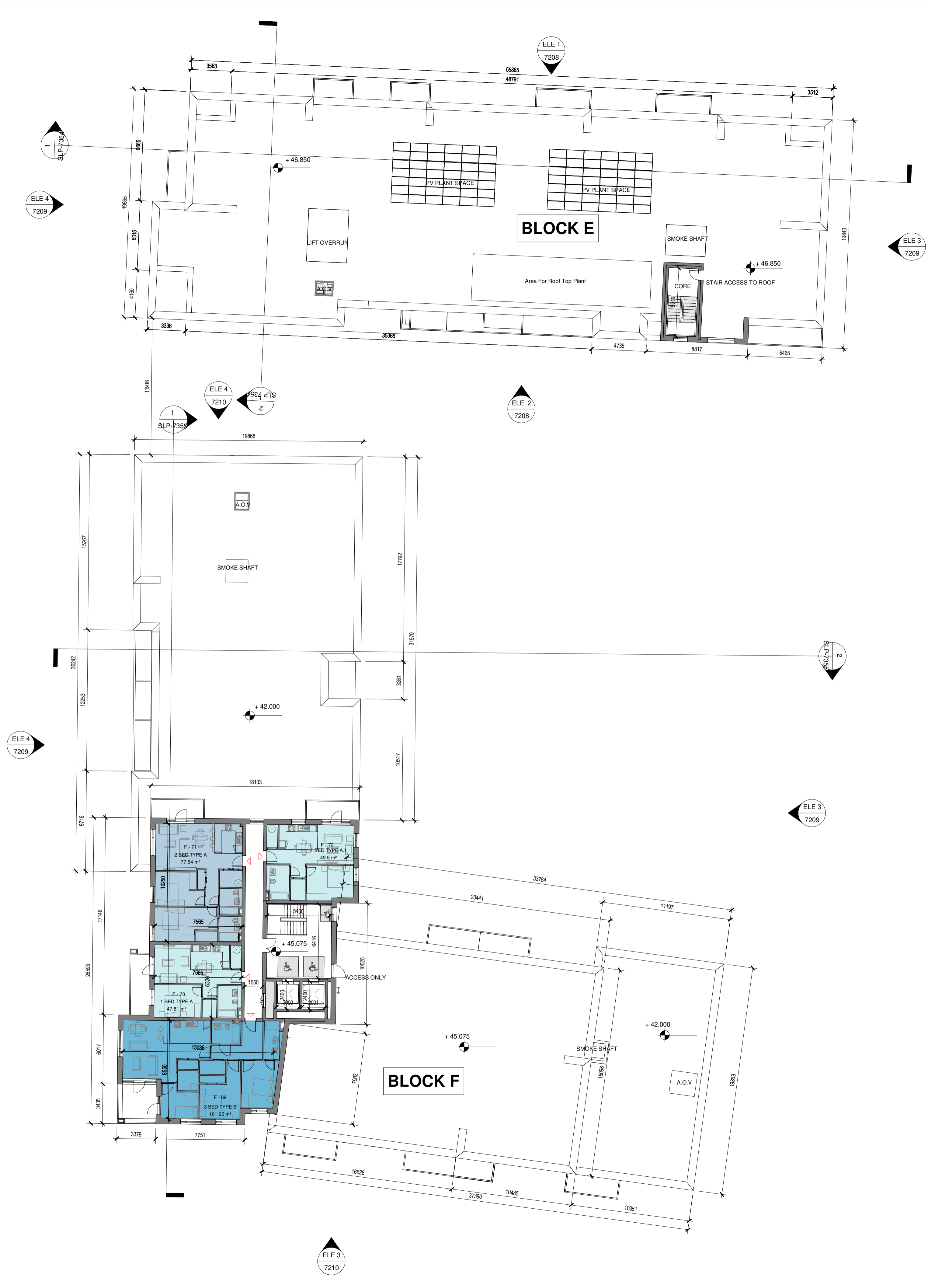
1 Floor Plan Level 05 Block E_F 1 : 200

MATCHLINE DRG. REFERENCE P18179-RAU-ZZ-XX-DR-A-SLP-7000